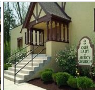
Our Lady of Mercy