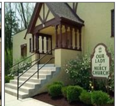
Our Lady of Mercy