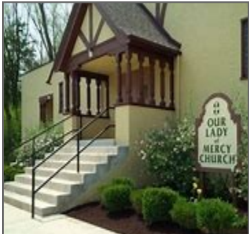
Our Lady of Mercy