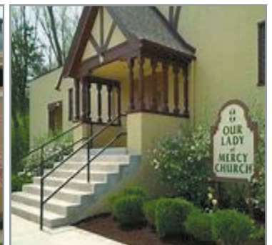
Our Lady of Mercy