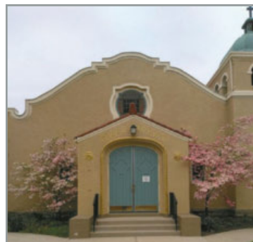
Corpus Christi Church