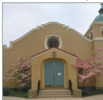
Corpus Christi Church