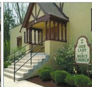
Our Lady of Mercy Church