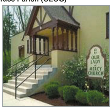
Our Lady of Mercy Church