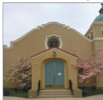
Corpus Christi Church